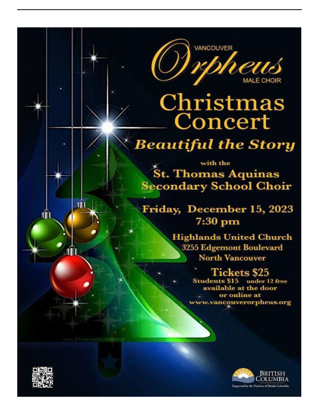
STA Choir Performance

Students are encouraged to attend interviews with their parents. There will be no classes for students on Monday, November 20.