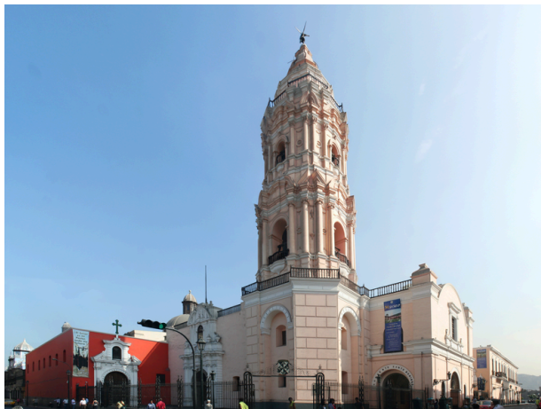
ST. THOMAS AQUINAS REGIONAL SECONDARY SCHOOL

Martin was the illegitimate son of a Spanish nobleman and a freed African slave with indigenous descent. Being of mixed race in Peruvian society during the sixteenth century put Martin under the scorn of many people. His mother, abandoned by Martin's father, was left to work her fingers to the bone for the survival of Martin and his sister. At age fifteen, Martin entered the Dominicans but only as a volunteer since Peruvian law forbade people of mixed race to enter a religious order. Some years later, the Dominican convent ignored the racist laws and Martin professed vows as a Dominican brother. He worked tirelessly aiding the poor and the sick, employing the medical training he had received even though he was not a doctor.