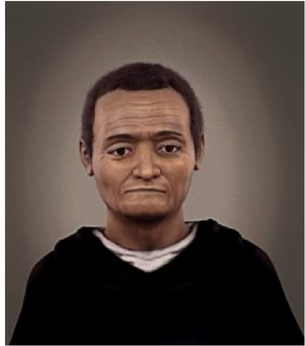
(Forensic facial reconstruction of the face of St. Martin de Porres)