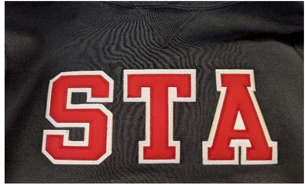
LOGO STYLE 2