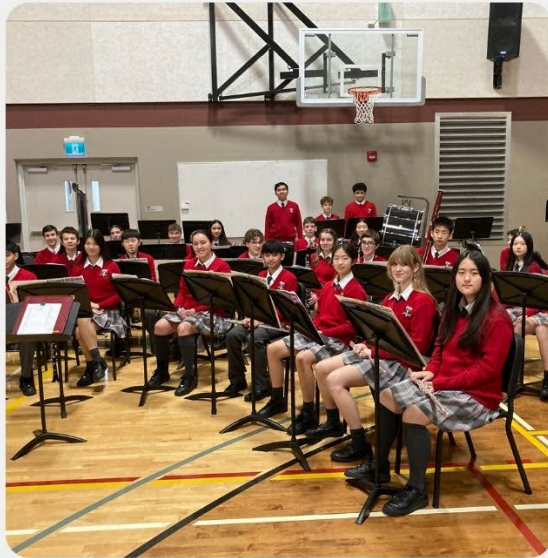
Our Christmas Concert and Art Exhibition was a joyful and inspiring celebration of student talent. The Choral, Band, and Jazz Band performances filled the evening with energy and holiday spirit. The Art Exhibition showcased outstanding work from Grades 9 - 12, reflecting students'