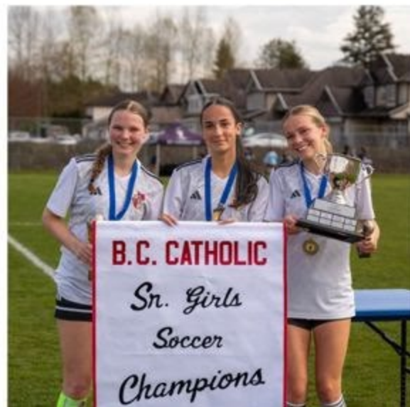
Congratulations to the STA Senior Girls Soccer team on winning the 2026 BC Catholic Championships last week with an impressive 3-0 victory over Notre Dame.