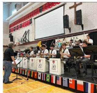
Junior Jazz Ensemble