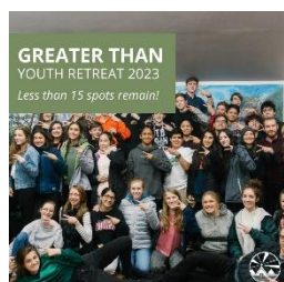
Greater Than Youth Retreat

For more information, visit: https://www.shad.ca/